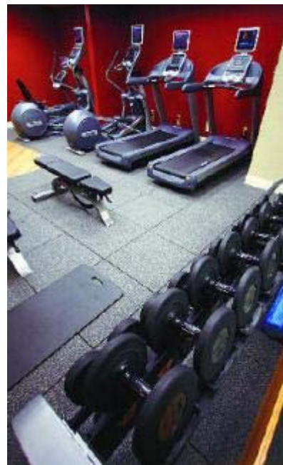
Below: The renovated workout room has more space and better equipment.